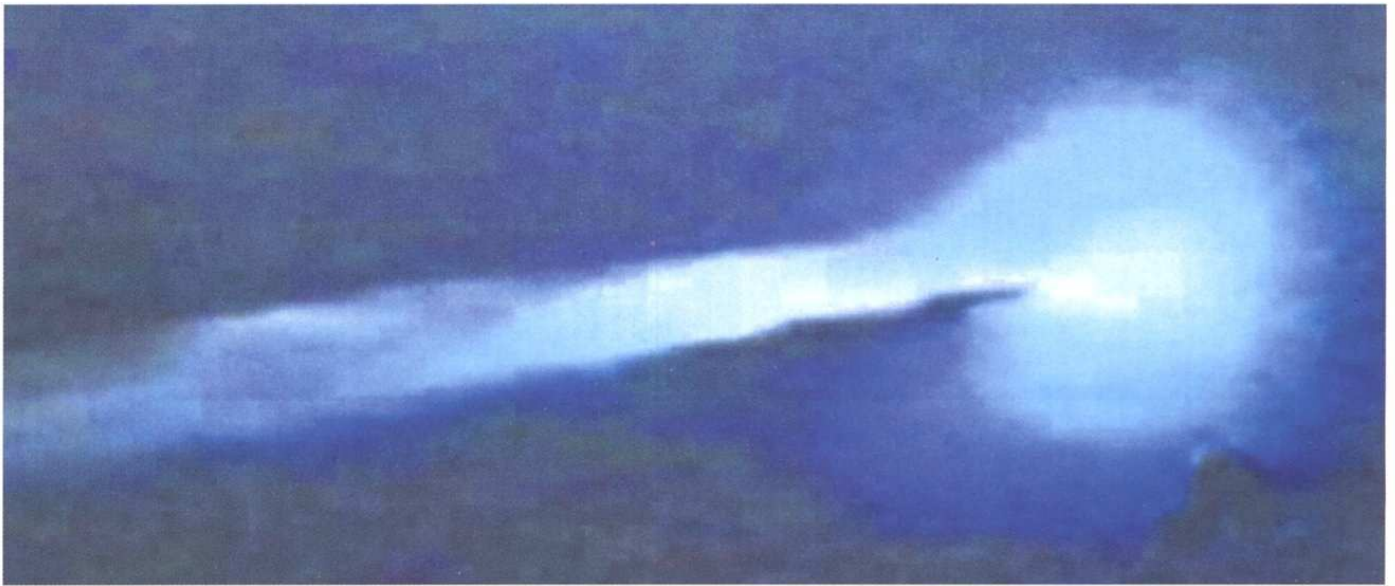
UFO 'close-up' over San Luis Potosí, Mexico, at 0100 a.m. on January 28, 1996, greatly resembling sighting at 0042 hrs a.m. over Monaghan district, Ireland, on January 16, 2001.

Today, 43 years later, now living in Canada, he has again contacted us and explained how he had been driven into "confessing". We plan to publish the whole story in a future issue of FSR.